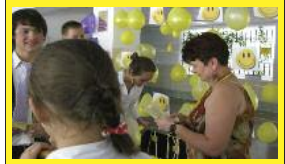
The launch of the Human Rights Friendly Schools project in Liceum Ion Creanga, Moldova.

In Liceum Ion Creanga in Moldova, the Amnesty International School Group is the driving force behind the school's human rights education activities. The group organised a 'Day of Friendly Communication' to improve school community relations. Teachers and students performed on stage and participated in discussions. Flash mobs have also been planned to draw the attention of the school administration to problems such as unsanitary conditions in the school canteen and safety issues in school corridors.