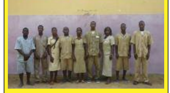
A group of students from Pahou College, a Human Rights Friendly School in Benin