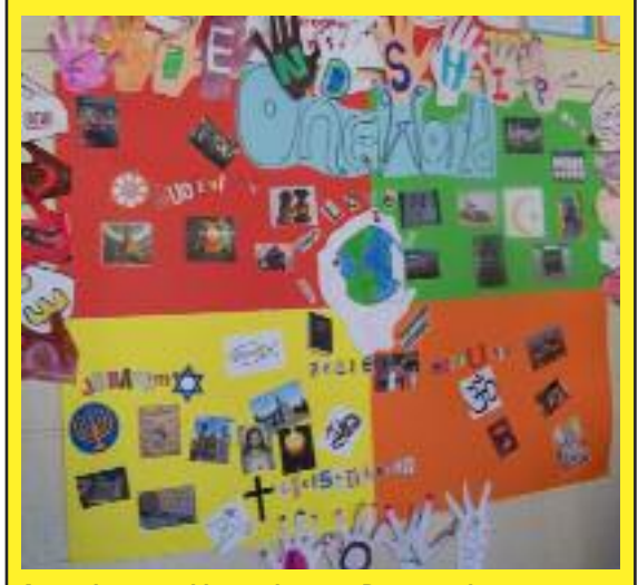
Artwork created by students at Presentation Secondary School, Warrenmount, as part of their 'One World' week, a celebration of cultural diversity.

The Vice Principal in Presentation Secondary School , Warrenmount , Dublin, recruited an advisory committee consisting of parent, teacher and student representatives. The advisory committee are involved in identifying how human rights can be further integrated into school values. They have discussed and written the school mission statement, which expresses the respect the school community has for human rights, and its determination to promote these rights.