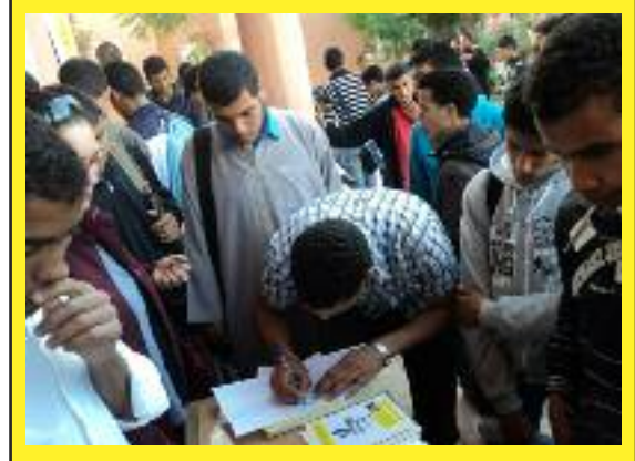
Students at Lycée Ibn Youssef take part in an Amnesty International letter writing marathon in December 2010.

Staff and students in Lycée Ibn Youssef have come together to improve school community relations and to promote awareness of human rights within the school community. Members of the school community identified that there was a high risk of female students being attacked at break times. As a result, a safe space where they can spend their breaktimes has been assigned.