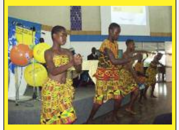
Students from Accra High School performing a traditional dance during a Demand Dignity campaign event.

Accra High School declared a week of campaigning to promote the abolition of the Death Penalty in Ghana. The school held a public press conference and demonstration, built a death penalty coalition and presented petitions to the President of Ghana and Members of Parliament on Human Rights Day, December 10th. The school also organised mock parliamentary debates, organised a drama production and took part in a letter writing action on the use of the death penalty in Equatorial Guinea.