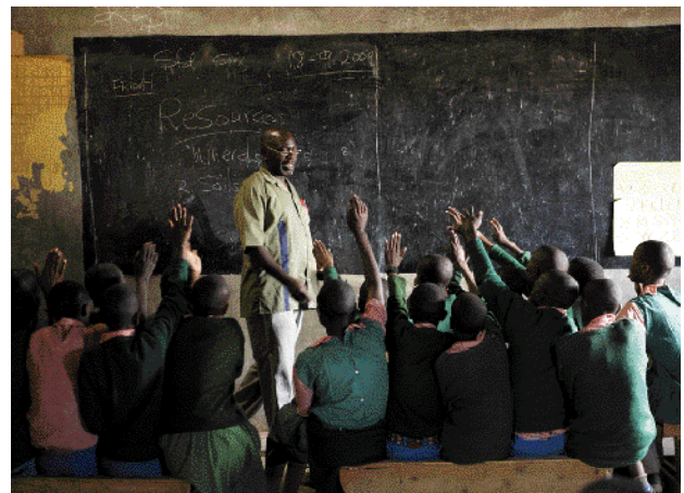
Ntuka Primary School, Narok, Kenya