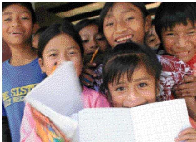
San Carlos Alzatate – Salitre community in Guatemala