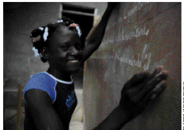
Writing onto a blackboard, Haiti