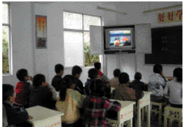
Children watching a disaster preparedness movie at Wujinhe primary school, China