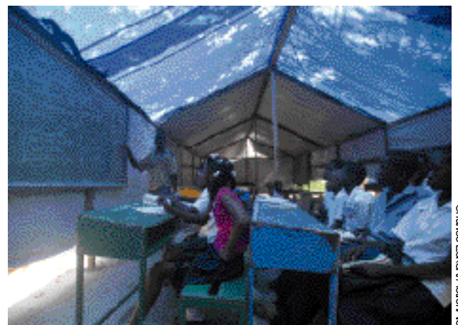
Six months after the hurricane students attend school under tarpaulin across the road from their damaged GREBBD School in Carrefour, Haiti