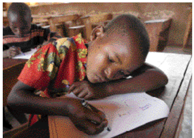
Nikuze in Karusi primary school, Burundi